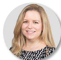
CHIEF FINANCIAL OFFICER