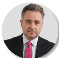
CHIEF EXECUTIVE OFFICER